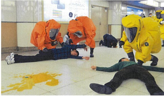
Figure 2: Rescue workers in hazmat suits and gas masks helping the injured.

The attack has shown the possibility of terrorists easily using chemical gas such as sarin, declared by the United Nations as a “weapons of mass destruction.” 18 Due to the advancement of technology, anyone can obtain unconventional weapons with ease.