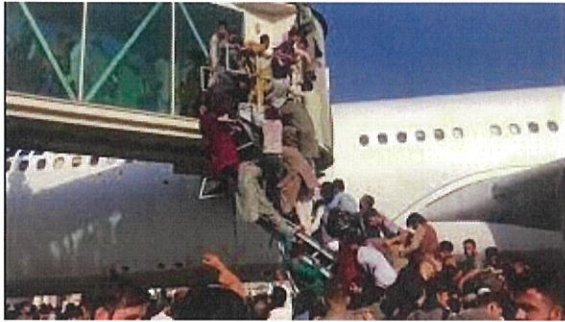
Figure 9: People clinging to US planes in Afghanistan as the Taliban captures Kabul.

million people depend on humanitarian aid in Afghanistan.