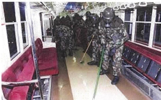
Figure 3: Japan Self-Defense Forces chemical troops removing poisonous substances.

The attack has shown the possibility of terrorists easily using chemical gas such as sarin, declared by the United Nations as a “weapons of mass destruction.” 18 Due to the advancement of technology, anyone can obtain unconventional weapons with ease.