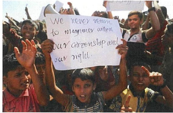
Figure 7: Rohingya refugees protesting for citizenship on the Bangladesh-Myanmar border.

Due to the influence the power to veto has, the Security Council has failed to take meaningful action to protect the Rohingya people. In addition, the international community has ignored the Rohingya crisis, considering it as Myanmar's internal affair. 27 The Security Council has only responded to the genocide, stressing the "primary responsibility of the Myanmar government to protect its population." 28