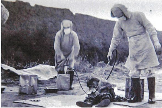
Figure 1: The Japanese Imperial Army testing biological weapons on Chinese prisoners 10

within a matter of hours. 9 These prisoners would likely have died before getting any treatment.