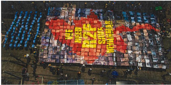
Figure 6: Young people seeking help from the international community on the streets of Yangon, Myanmar.