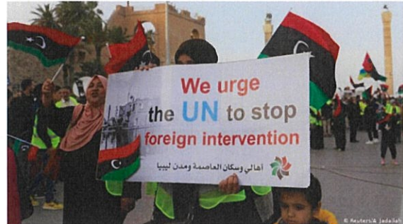
Figure 5: Libyan citizens calling out to the international community to stop intervention.

While foreign aid is necessary, we must have a wider perspective and consider the negative effects of too much foreign intervention on a country, especially a state under disorder.