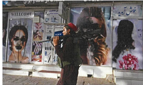
Figure 8: Posters of women at a Kabul beauty salon painted over as Taliban fighters seize the city.

At the emergency session of the Security Council, during chaos at the Kabul airport, the Secretary-General highlighted that “now is the time to stand as one” and voiced concern over “mounting violations against women and girls,” stressing the need to protect “the hard-won rights of Afghan women and girls.” 31 It is obvious that Afghanistan is in need of aid from the international community. The effects the situation in Afghanistan has on the world forces countries to take action and provide support, not only for Afghanistan, but for its own country as well. Currently, roughly 18